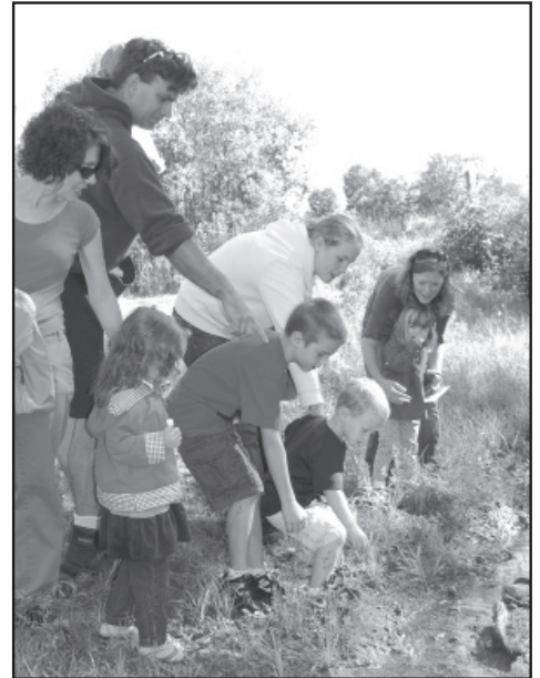
Kids and parents search for frogs in the stream at Hackett's Orchard