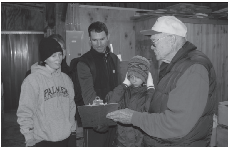
Families get a tour of the sorting room at Hackett's Orchard, watching the apples float onto the conveyer belt and be sorted