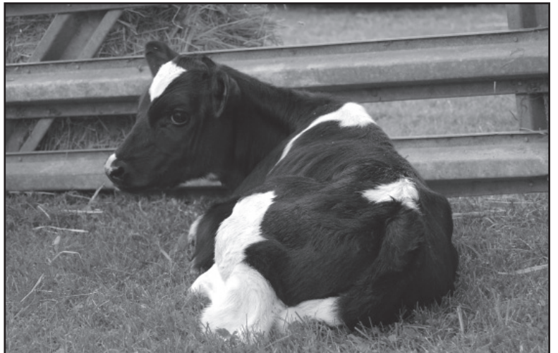
A new calf from Islandacres Farm visited the South Hero Farmers' Market on a rainy day, much to the delight of children