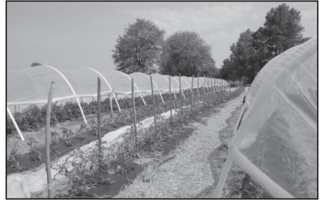
High tunnels protect young peppers & tomatoes at Darby Farm in Alburgh

Farmers in the Champlain Islands are practical, skilled, and really good at growing crops in our unique environment. They know how to care for the land, and when to plant corn, peppers, or tomatoes. They adapt to changeable weather patterns, and face the risks of early frosts, flooded fields, or harsh winters with flexibility and optimism. They are interested in new ideas, specialty crops, and new agricultural techniques. They are excited to expand and meet new market demands, to cooperate in the production of unique regional foods, and to participate in training new generations of farmers.