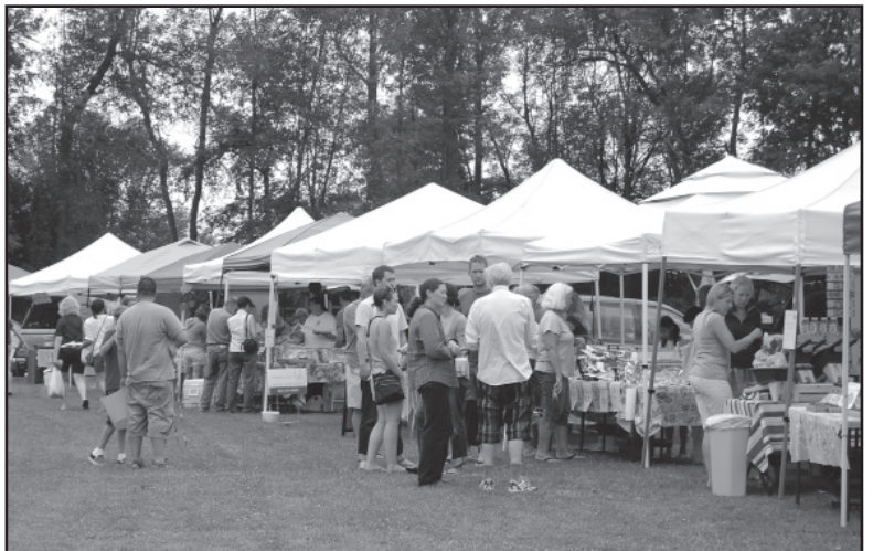
Islanders gather at the farmers' market to buy fresh produce, tasty meals-to-go, special treats, and catch up on the latest news!