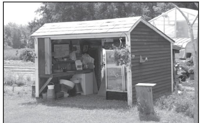
The farm stand at Savage Gardens in North Hero has vegetables, berries, & eggs for sale