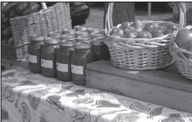
MR Harvest of Grand Isle sells fresh tomatoes and tomato sauce at the Farmers' Market

Some of the goals of the group include: producing high quality agricultural and value-added products in the Champlain Islands, being environmental stewards of the natural resources and working landscape of the Champlain Islands, helping our local community and citizens thrive through improved farm viability, and creating an Islands brand that will increase recognition of our quality Islands products. The network hopes that by working together and sharing resources, they will be able to positively impact the future of agriculture in the Islands.