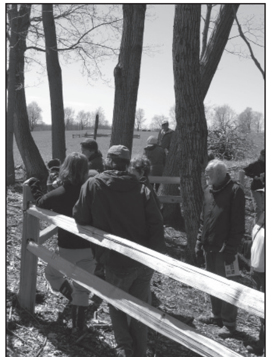
Walkers enjoy the view and dappled spring sunshine through the branches of maple trees at the height of the trail