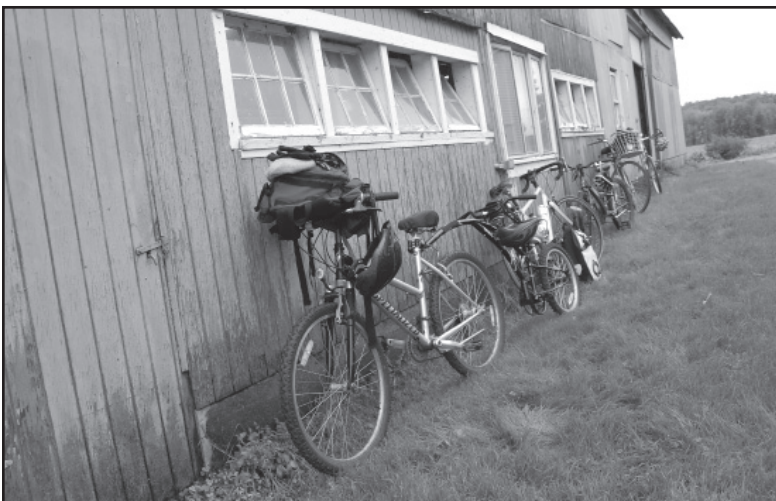
Bicycles line the barn at Islandacres Farm, where families were treated to a visit with the cows and new calves