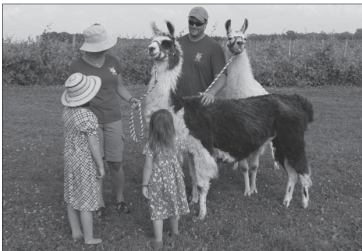
A couple of four-legged visitors at the Snow Farm dinner.

The farmers, chefs, bakers, and other food business entrepreneurs of the Islands who are members of the Lake Champlain Islands Agriculture Network just wrapped up a second wonderful summer of farm dinners. The network exists to support a forum for farmers and other business owners to exchange ideas, learn from and support each other, encourage innovation through collaboration and partnership, connect to consumers as an agricultural community, and build markets for Islands agricultural projects.