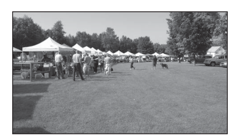
Vendors tents fill the green behind St. Rose of Lima Church during the farmers' market.

The South Hero Farmers' Market moved to the green behind the St. Rose of Lima Church on Route 2 this summer. This new location, with plenty of parking and a much larger lawn, allowed the market to spread its wings a little and expand to fill the space. South Hero Land Trust sponsored six educational theme days at the market. These included returning favorites like the Youth Farmers' Market, our annual Fiber Day, and the tasty "Flavor of the Islands," where customers had a chance to try new dishes made with local produce! We also partnered with South Hero's Islanders Caring for the Environment (ICE) to sponsor "Everything Energy," a local energy fair. Members of the Committee with expertise in solar energy, energy efficiency, and green lawn care presented booths, as did the Northwest Solid Waste District and a Vermont building and consulting firm called Building Energy. The second year of the Winter Market began in November and will continue through April, check page 8 for dates and times.