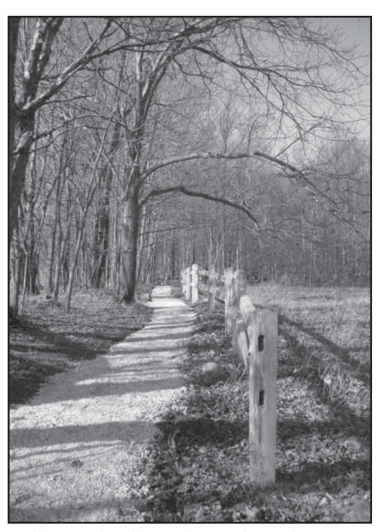
The completed fence frames the trail entrance beatifully.

Interested in helping South Hero Land Trust build and maintain the Landon Community Trail and the Round Pond State Park Trail? Join Friends of Round Pond and we'll keep you updated when we have work days. Contact Emily at 372-3786 or emily@shlt.org.