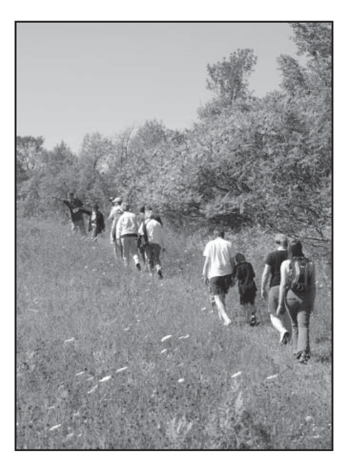
Hikers at Round Pond State Park enjoy a sunny morning with Lake Champlain Land Trust and South Hero Land Trust.