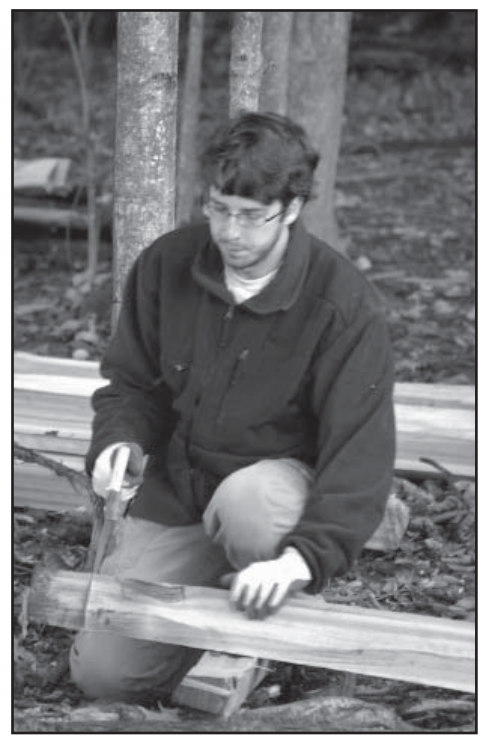
A UVM student cuts a fence post to size.