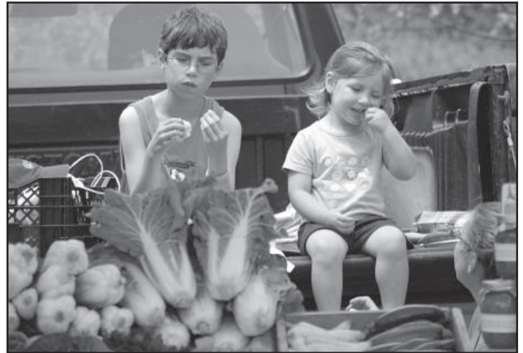
The Hood family enjoys a fresh, local snack at the farmers' market, from the back of a farm truck!