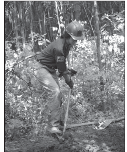
VYCC crew improving the drainage of the public trails at Round Pond

The all-women crew is part of the “Female Leadership Development Crew,” a VYCC program that builds both leadership skills and empowerment for women in the field of conservation. They spent nine weeks working on trails across Vermont. Thanks to VYCC, for all of your hard work on trails across Vermont!