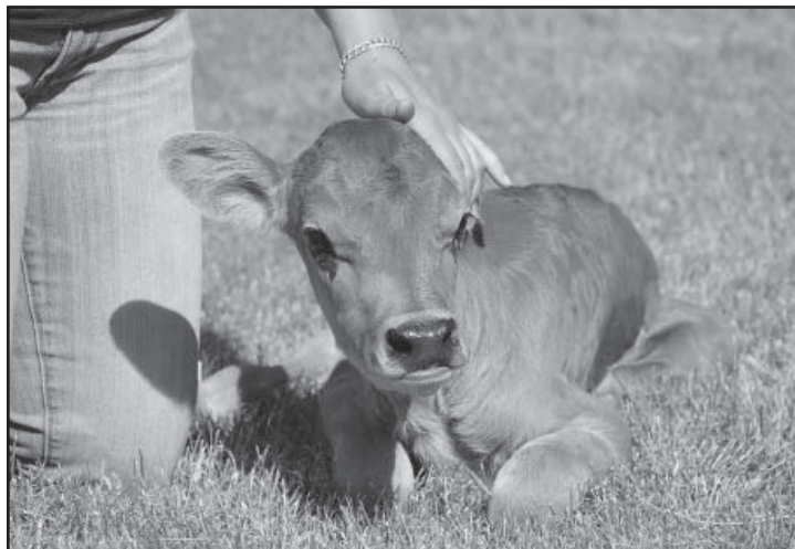
A Jersey calf from Lakeside Jersey Farm visits the Farmers' Market for SHLT's Annual Dairy Day

The efforts of the Champlain Islands Farmers' Market to better serve Island families of all income levels inspired SHLT to continue to develop our own efforts to connect farms and families. Through a grant from the VT Agency of Agriculture, we expanded the "Champlain Islands Grown Guide to Agriculture." We added information about the programs at the Farmers' Market, an agricultural calendar for the Islands that demonstrates the seasonality of local produce and fun local activities, as well as tips for eating local on a budget.