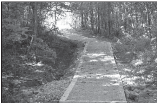
New “ladder” trail surface at Round Pond