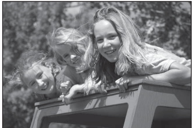
A group of local girls enjoy Hackett's Orchard during Annual Meeting