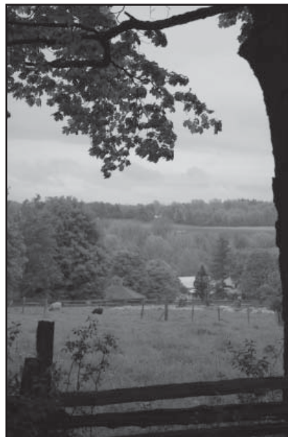
A springtime view of Lemon Lily Farm during a wildflower walk with Naomi King and Hobart Tracy