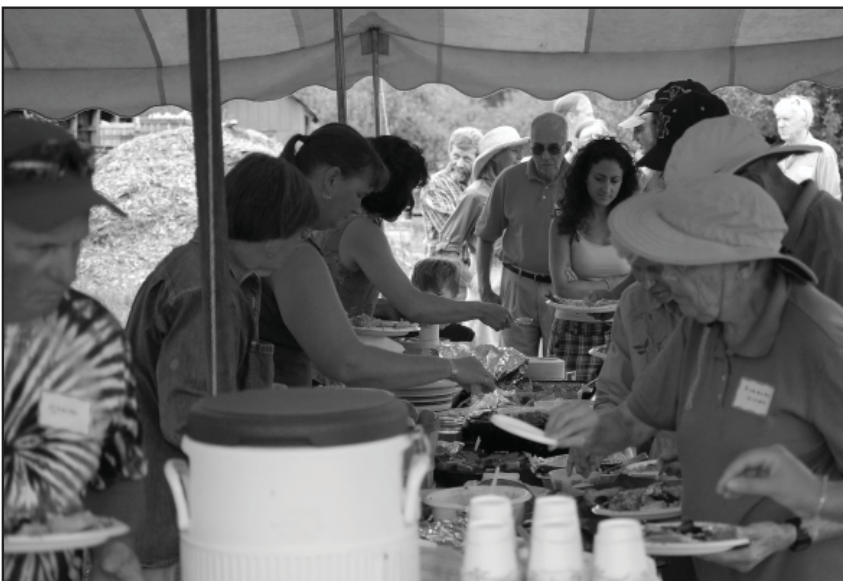
Community members gather for a delicious potluck feast under the tent