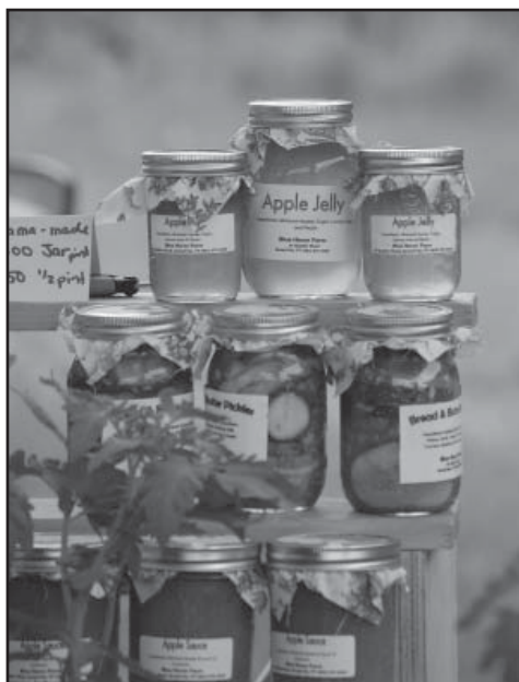
Jellies, pickles, and applesauce at the Champlain Islands Farmers’ Market

The Champlain Islands Farmers’ Market is getting ready for the summer. Farmers are starting seeds and cleaning out greenhouses. Crafters are tucked away in studios, building up their stock. Cooks and bakers are trying out new recipes. The first summer market in South Hero will be Wednesday, June 2 nd . Mark your calendars, and start dreaming of fresh asparagus and baby spinach!