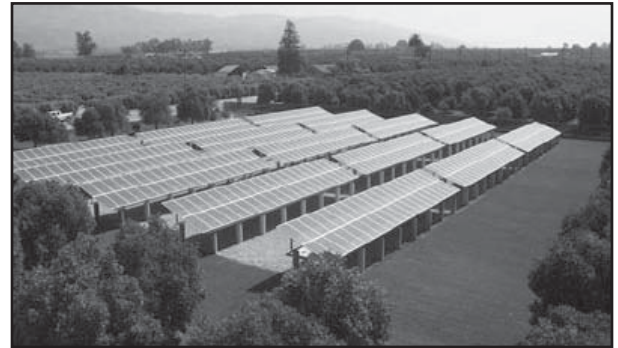
Solar photo-voltaic tracking system