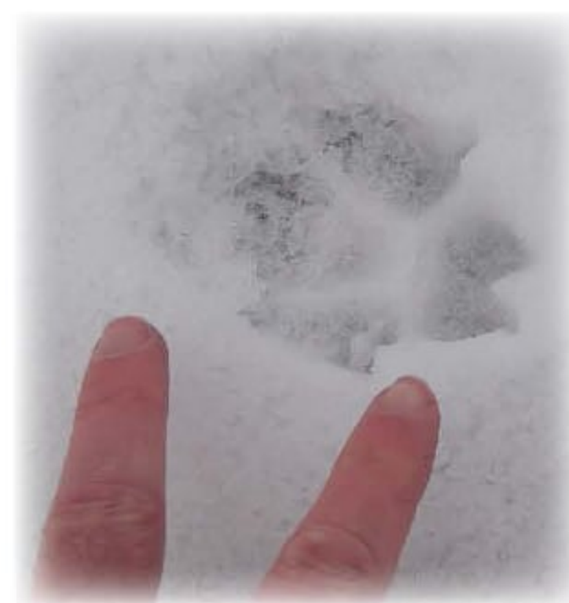
Fox tracks in the snow

Afterwards Warm up with your own hot apple spiced cider infused with honey and lemon. Stop by Keeler's Bay Variety on Route 2 and pick up some local cider from Hackett's Orchard, honey from North Country Bees, lemons and cinnamon sticks. Try this recipe from www.quericavida.com/recipes/warm-apple-cider-infused-with-honey-and-lemon/ Learn more about Hackett's Orchard and North Country Bees in the NW Vermont Guide to Agriculture at www.nwvtgrown.com .