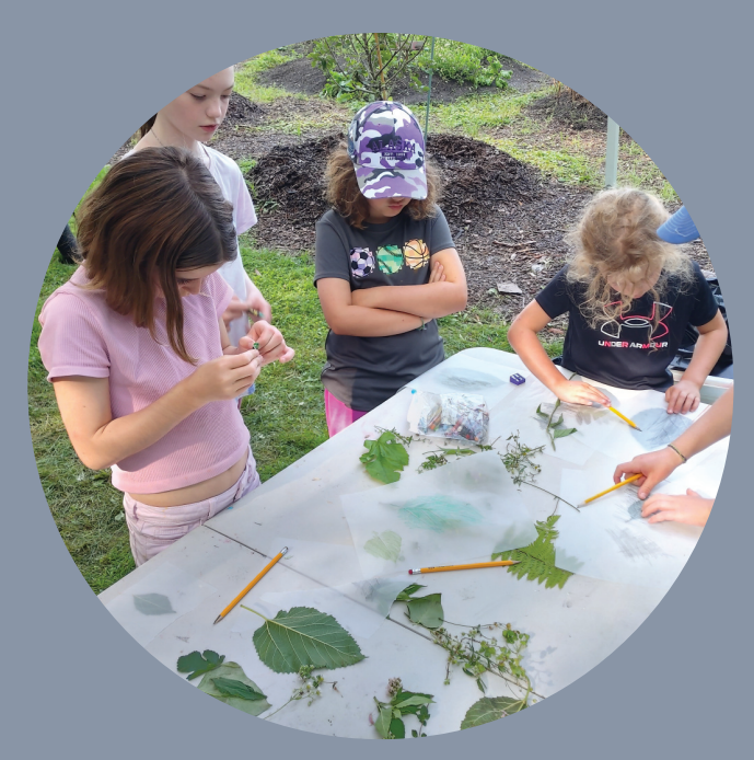
"Farmers and Foragers" summer campers, working on leaf tracings