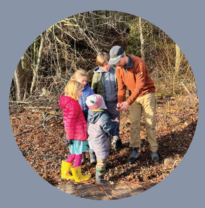
First Hike hikers celebrate the New Year at Round Pond State Park

We also launched a new series specifically for families with young children, encouraging kids and their grownups to explore the outdoors in all kinds of creative ways. Our first gathering in October brought 34 kids and grown-ups to Tracy Woods to watch the full moon rise and experience the sights and sounds of nature in the evening.