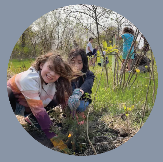
Folsom students planting cedar trees during SHLT's Spring Nature Club