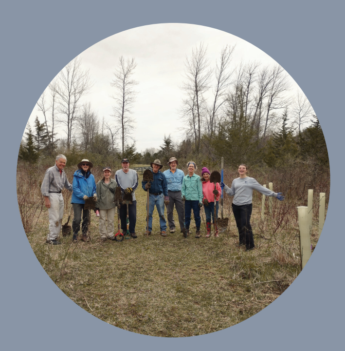
Volunteer work party on Earth Day

In response, South Hero Land Trust started an ambitious ecological forest management demonstration project at the South Hero Recreation Park. Staff and volunteers have been removing invasive buckthorn and honeysuckle, and planting climate-forward trees that fill a similar ecological role as Ash. These trees will help maintain healthy forest diversity, and make it possible to re-plant Ash trees in the future, when resistant varieties can be cultivated. In 2023 we planted over 400 trees and shrubs in the Recreation Park, and with your help more will be planted in coming years.